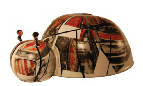
José Lazcarro Toquero, Catarina Lazcarroza , 2010, mixed media on clay, 20 x 47 x 35 cm. UDLAP's Art Collection.